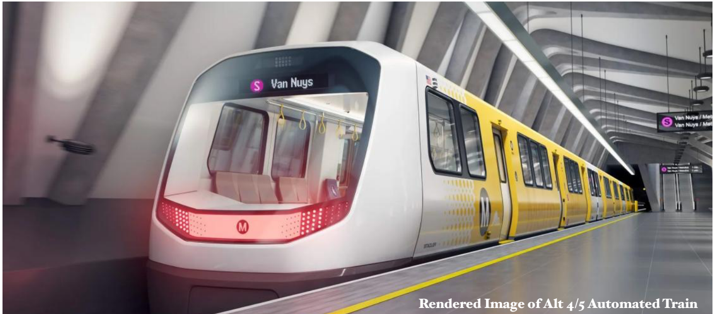
Rendered Image of Alt 4/5 Automated Train

Metro recently released the Draft Environmental Impact Report (DEIR) for the Sepulveda Transit Corridor Project , which aims to improve transportation along the Sepulveda Pass corridor, connecting the San Fernando Valley to the Westside of Los Angeles while also enhancing and complimenting Metro's inter-connectivity.